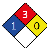
NFPA 704 diamond

Note: The hazard category numbers found in GHS classification in section 2 of this SDSs are NOT to be used to fill in the NFPA 704 diamond. Blue = Health Red = Fire Yellow = Reactivity White = Special (Oxidizer or water reactive substances)